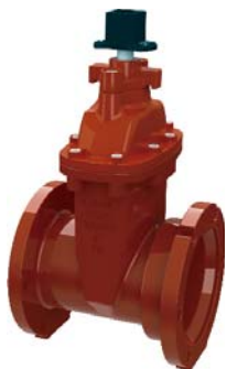
Flange x Mechanical Joint