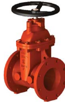
Flange x Flange