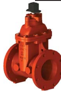
Tapping Valves w/Flg. Side Acc.