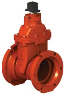
Mechanical Joint x Mechanical Joint